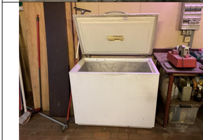
Fryser - 2 stk.