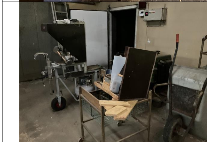
Sorteringsvogn, hedvandsrensner mm.