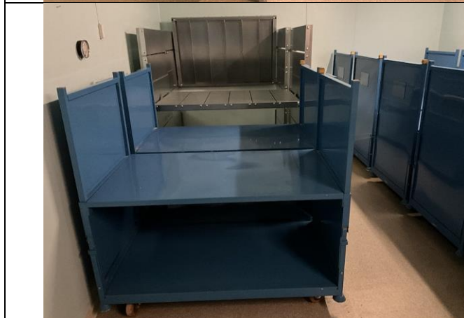
Vogne - 17 stk.