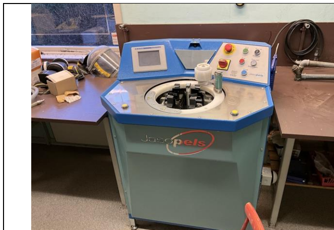
Tanemaskine - 2 stk.