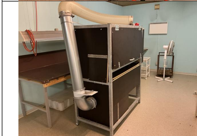
Skindrener - 3 stk.