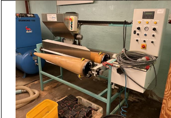
Skabemaskine - 2 stk.