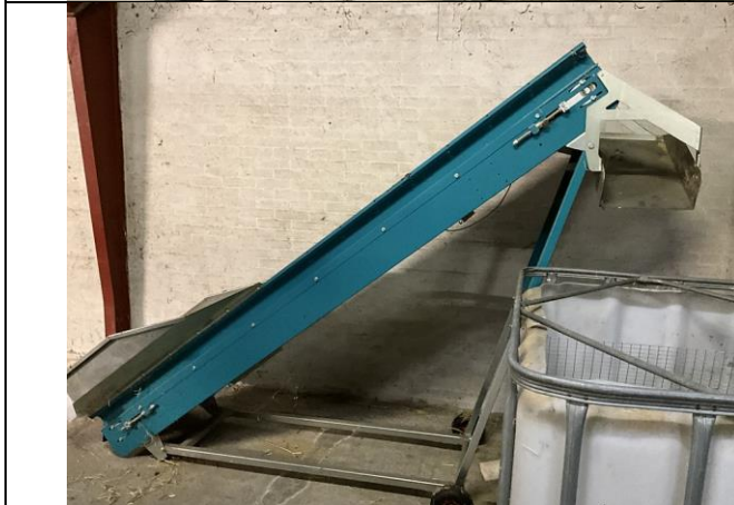
Transportbånd - 2 stk.