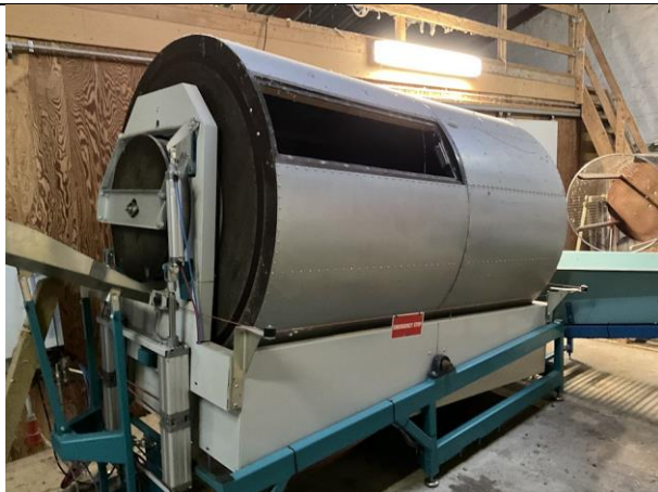
Kropstromler - 4 stk.