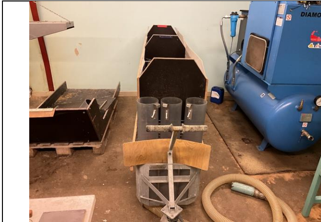
Fældevogn - 2 stk.