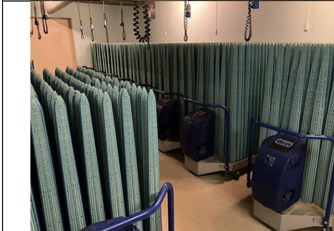
Tanevogn - 16 stk. og tane.